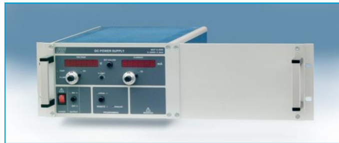
Rack adapter for a 1/2 19" unit with 1/2 19" blind panel