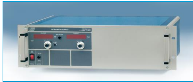
Rack adapter for a 19"- unit

For retrofitting of 19" rack adapters please state the height of the front panel!