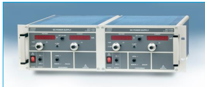
Rack adapter for two 1/2 19" units