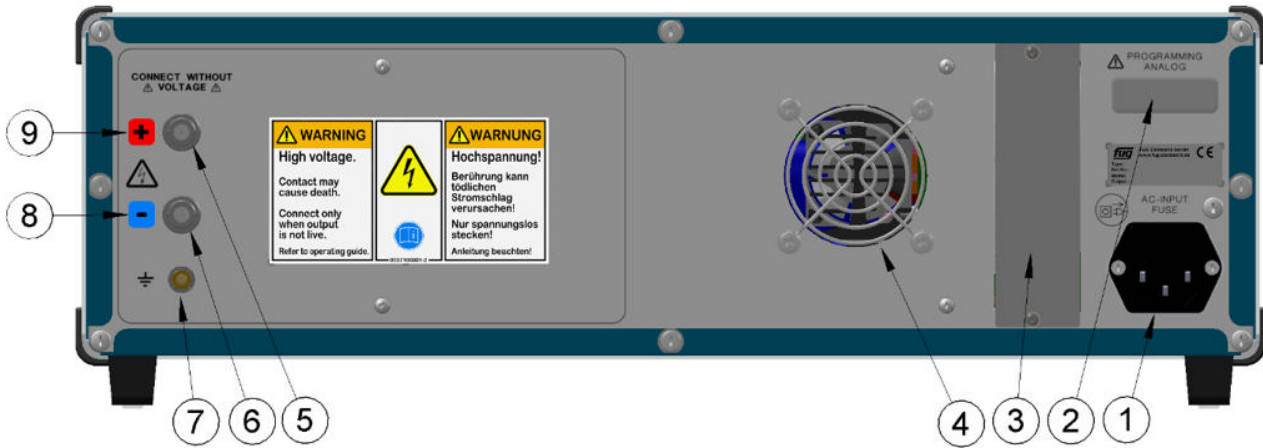
Figure: Rear panel – sample MCP 700 – 2000. For DC power supplies with higher performance or other voltages, other dimensions may apply. The arrangement of the elements may be different from that, shown here.