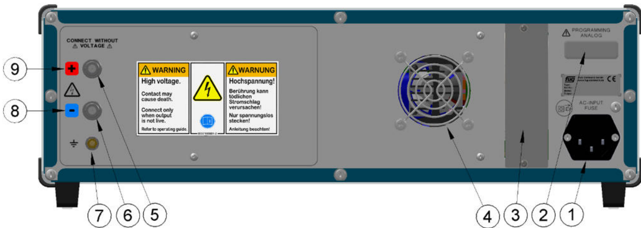
Figure: Rear panel – sample MCP 700 – 2000. For DC power supplies with higher performance or other voltages, other dimensions may apply. The elements' layout may vary from that shown here.